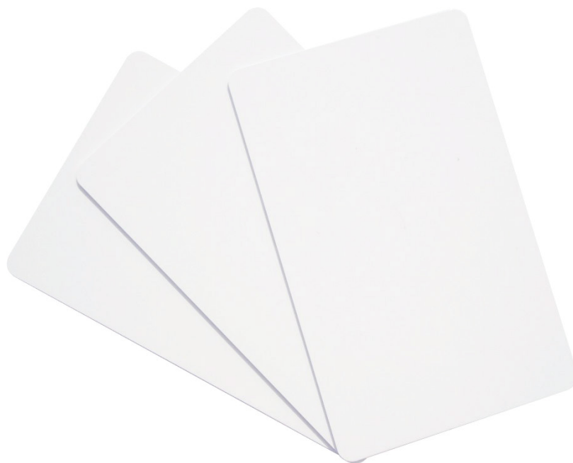
PVC UHF BT-UHFIDC Card